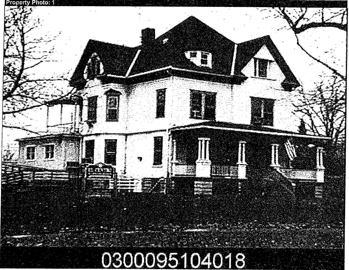
Property Photo: 1