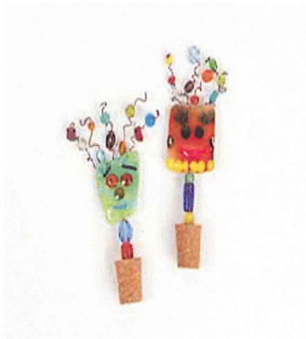
Wine Tasting Cruise Bottle Stoppers